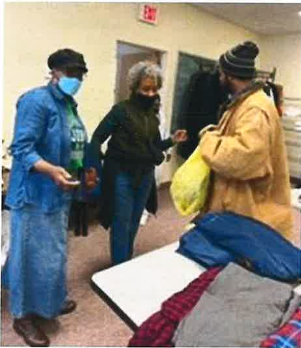
Photo: Clothes Closet Staff and Community

A tool to communicate regularly with our membership that would encompass pertinent information such as seasonal greetings or a special message, calendar of upcoming events, a call to volunteer or to get involved, congregational news, etc. Any essential information about the goings-on of our church.